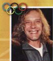
RALPH BURGHART 1992 Olympian 7 time Austrian National Champion