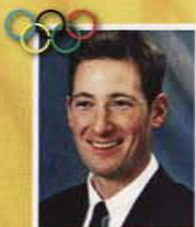
PHILLIP DULEBOHN 2002 Olympian 7 time USA National Medalist 4 time World Team Member